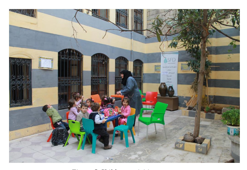
Figure 5 Children activities

While the center was open it was successful and popular among the local population. In total, the center, welcomed more than 7,500 women and 3,000 children.