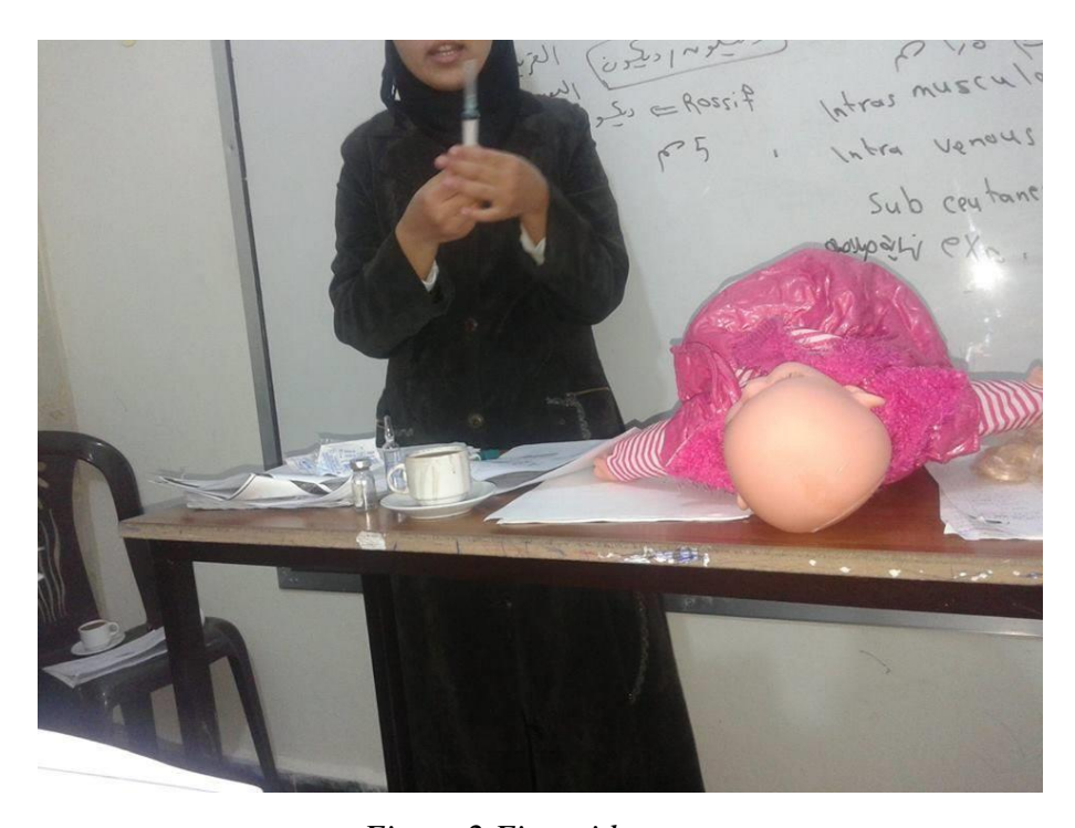
Figure 2 First aid course

The center welcomed 670 beneficiaries in 2014.