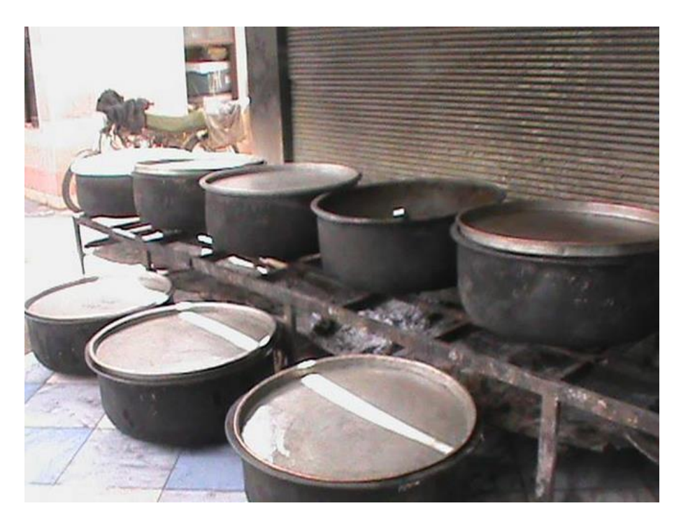
Figure 11 Kitchen utensils

The worsening situation in Syria has made it difficult to support income generating activities inside the Ghouta and for this reason Soriyat For Development has chosen to support a female solidarity initiative founded by a female activist. The project is called "one same hand" and it works to provide meals to the impoverished families of the Ghouta. The project works in solidarity with Syrians outside of the Ghouta. The founder of the project cooks to feed 100 to 300 families each day. When the project first began, she had few kitchen tools at her disposal, making it difficult to prepare enough meals to feed all the hungry families. Soriyat For Development chose to support this project for two reasons. First, to allow the founder to make enough food for the as many people as possible, and with the assistance of SFD the founder was able to buy the kitchen utensils and firewood she needed. Secondly, SFD works to support female activists and encourages women to become active participants in their communities, for this reason it was important to support this project so other women could have a successful female role model to follow.