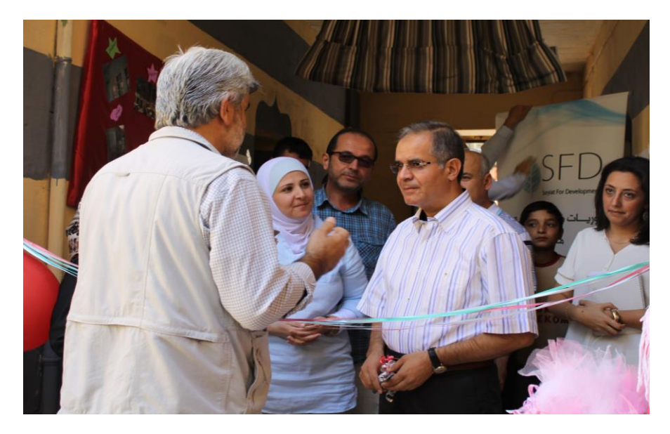
Figure 4 Killis Center inauguration