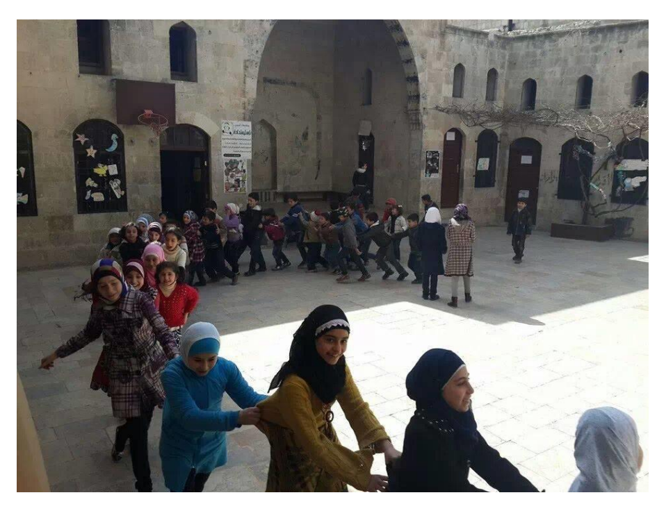
Figure 8 One of the last picture we took in Aleppo, March 2015: the happiness train.