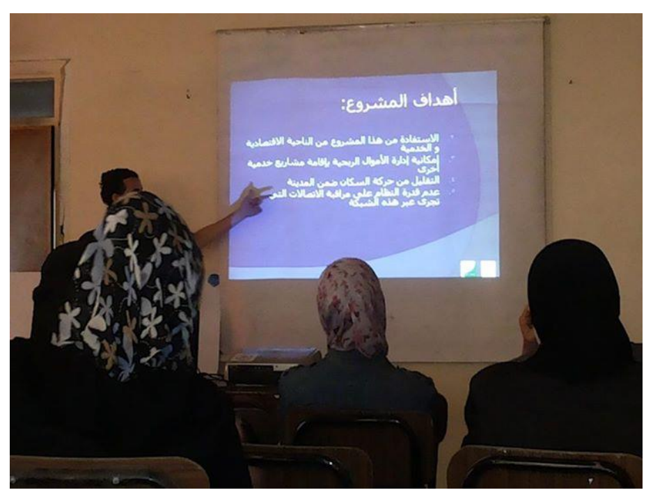
Figure 1 Project management training

Limited financial resources meant that it was not possible to open more centers in the Ghouta. SFD is therefore supporting a literacy project, in a third village, which benefited women of the Ghouta for four months.