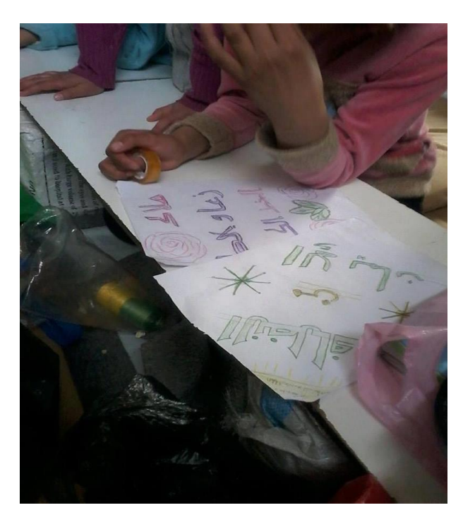
Figure 9 Children activities