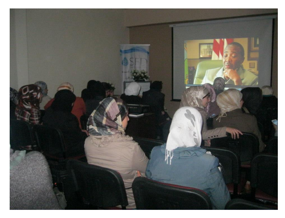
Figure 3 Film about the role of women in politic